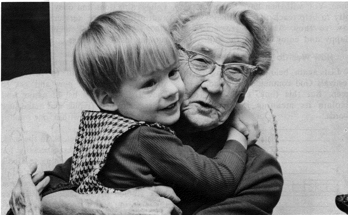
American Stock Photos

After the Millennium, you will be able to help show God's way of life to those who have never known God's truth. You might even be teaching some of your own relatives!