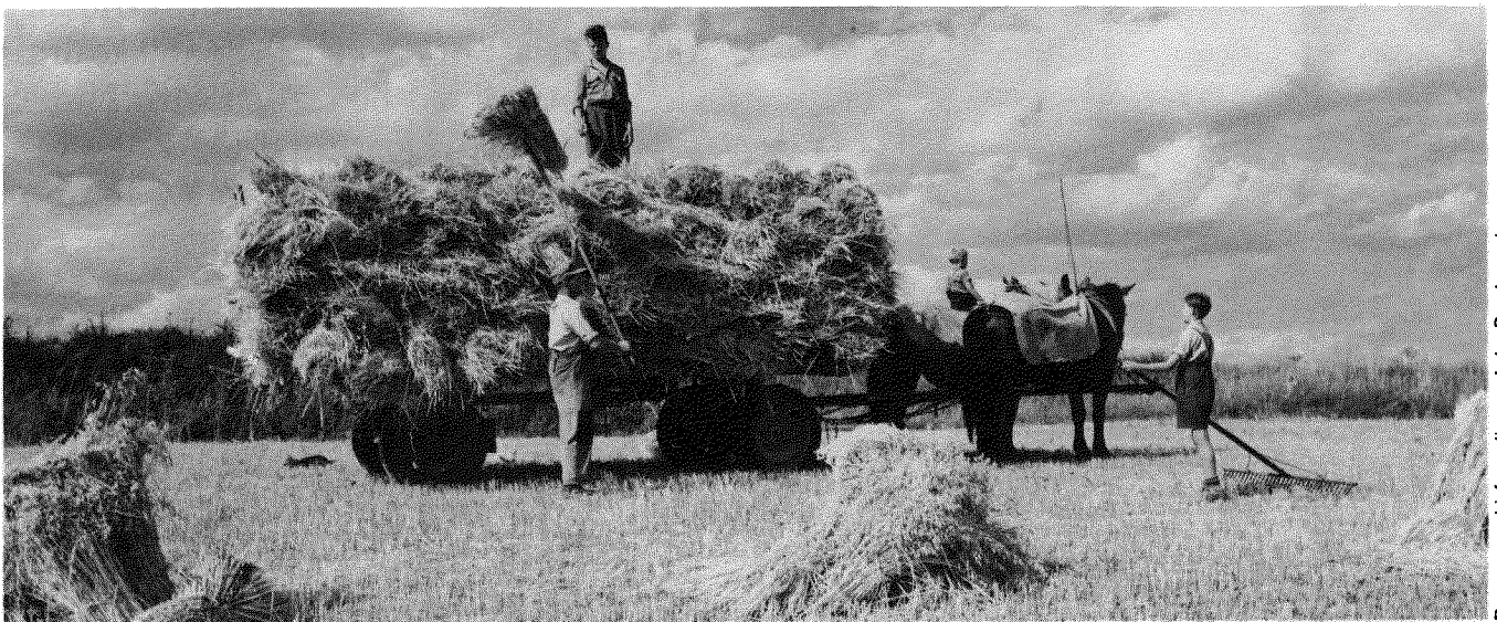
Presse- und Informationsamt der Bundesregierung

The Feast of Trumpets is a joyful day because it pictures a happy new beginning under God’s government. But before God’s government can make this