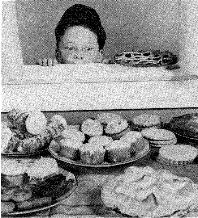
Before the Days of Unleavened Bread, all foods with leavening must be put out of the house.

The third spring festival is the Day of Pentecost. It shows us how God is calling only a few people to understand His truth now. The vast majority of mankind will be called to understand later!